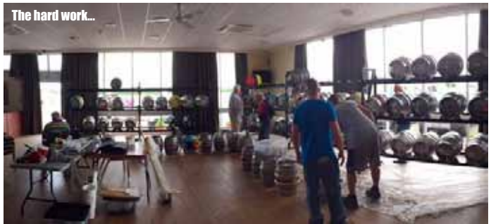
The hard work...

"Having a long relationship with the Shakespeare Hospice - a charity dear to a lot of people - we invited them back to raise money at the festival once again and they raised a massive £1200"