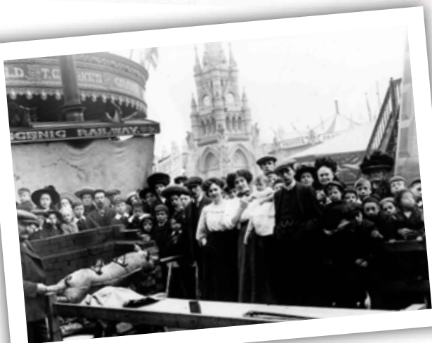
Pig roast at the Stratford-upon-Avon Mop Fair

If you want to hear and join in with the choruses of traditional songs in the Shakespeare CAMRA area, try the following places:-