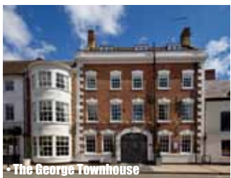
• The George Townhouse

Tyre . Almost next door is THE GEORGE TOWNHOUSE and here the two regular beers of Brakspear Bitter and Oxford Gold were joined by Wainwright now brewed by Marstons .