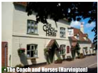
• The Coach and Horses (Harvington)