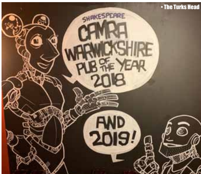
• The Turks Head

Beer Drinker, Reader or CAMRA Member - the reports and short stories below all come from people like yourself, so if you find yourself in one of our wonderful pubs, feel free to drop us a note about anything you think should be in this section! editor@shakespeare.camra.org.uk