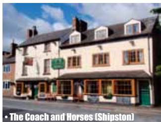
• The Coach and Horses (Shipston)

Across the road at THE WHITE BEAR the three usual Donnington ales were on handpump together with Spring Hopper from Arkells . Two real ciders are available namely Old Rosie and Flat