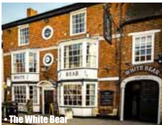
• The White Bear

It is good to see such a large choice of ales and all different. Real ale is evidently much in demand in Shipston and other places in the Branch at present and this reporter can only rejoice in what has happened in his 50 years of sampling. Whilst living in the Warwickshire village of Newbold-on-Avon in the late 60s his