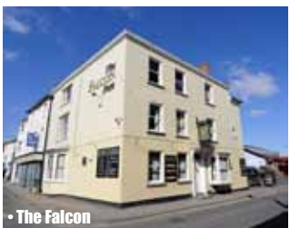
• The Falcon

and from these four or five are served every day. Also five ciders and perries are kept. Finally a 200 yard walk along Station Road took me to the thatched BLACK HORSE . Licensed since 1540 this is Shipston's oldest pub and has four handpumps. Regulars are Prescott Hill Climb and Wye Valley Butty Bach plus Hogan's Harvest Press cider and the fourth handpump was dispensing Cotleigh Amadeus .