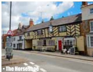
• The Horseshoe

Diagonally opposite and close to the bus stop is Shipston's first micro pub THE THIRST EDITION . A blackboard notice proclaimed that since opening at Easter 2018 the pub had sold 240 different beers with a further 53 repeats. This total has included the whole range from nearby North Cotswold Brewery at Ditchford and the whole range of Clouded Minds Brewery in Brailes. The micro pub opens at 4pm during the week and 3pm Saturday/Sunday. Ten casks are racked on stillage