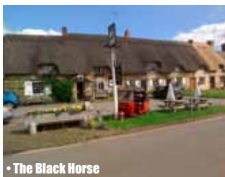
• The Black Horse

two locals were THE BOAT serving Davenports Bitter and THE BARLEY MOW serving Draught Bass both served by handpump. The words real ale and cask conditioned had to wait to be introduced when CAMRA was born a few years later but he was fortunate to find agreeable beer in both pubs. Many pubs elsewhere were keg only. Alas in recent years THE BOAT has closed its doors.