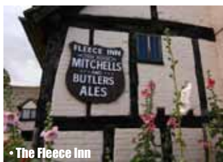
• The Fleece Inn

THE FLEECE has been named as the best pub in Britain by the Bristol-based travel guide Sawdays. It scored top marks for its cosy atmosphere, vast array of local beers and cider and gutsy, hearty food offerings.